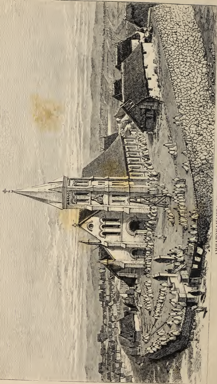
AMBATONAKANGA CHURCH, MADAGASCAR.